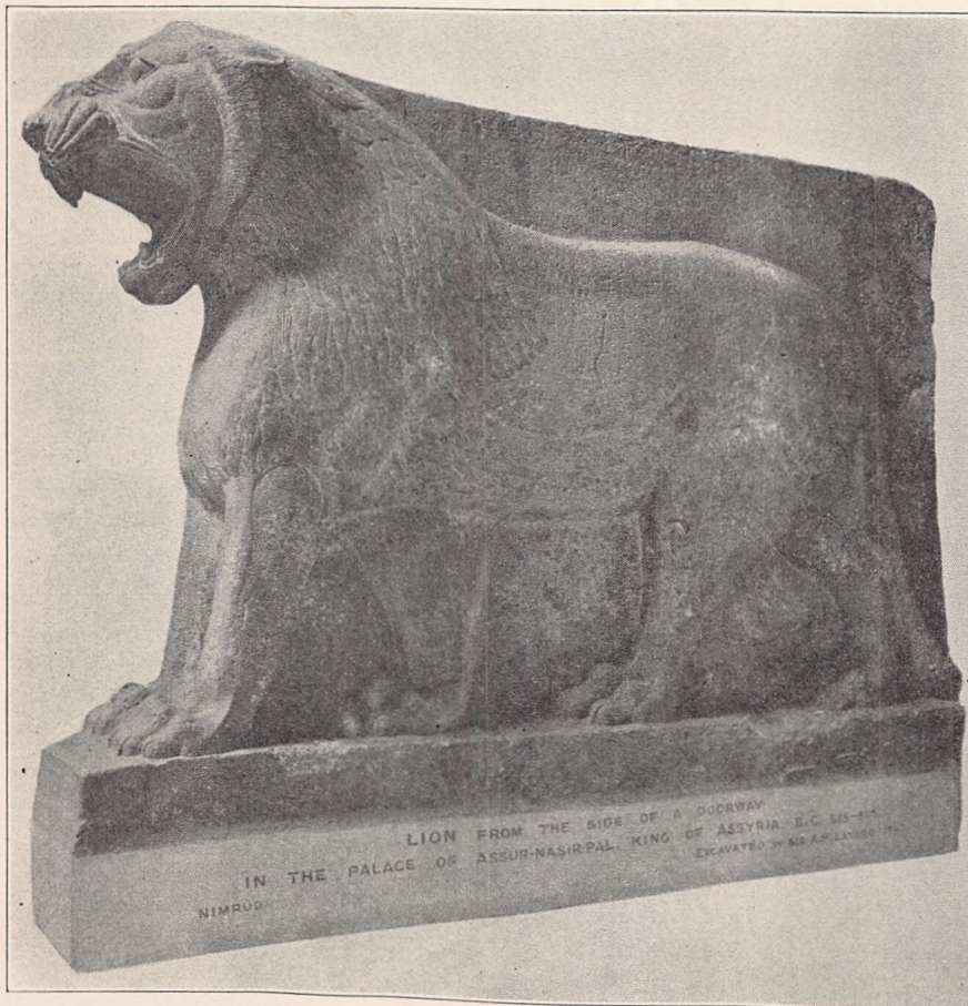
LION from the side of a doorway in the Palace of Assur-Nasir-Pal, King of Assyria, B.C. 885-860—Nimrud.

We can hardly avoid bringing into the same general category with the sphinxes the huge figures which Mr. Layard brought home from Nineveh, and which he describes as winged human-headed lions. As we gaze at them in the British Museum we admire the moulding of the body and limbs. The muscles and limbs, though devel-