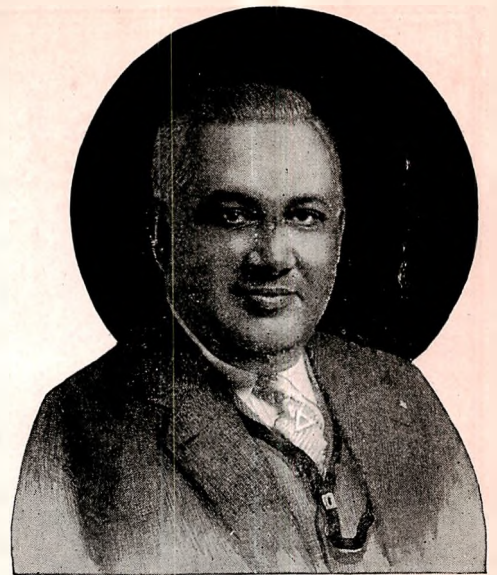
H. SPENCER LEWIS, Ph.D., F. R. C. Emperor of the Rosicrucian Brotherhood

ARE you weary of reading the books that tell you about the wonderful things accomplished by the master minds of the past? Are you tired of hearing what can be done with the mystic laws of mind and matter, without being told how YOU can do these things, easily and surely?