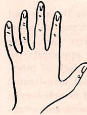
The Psychic Hand

If you have a PSYCHIC HAND —That is, the palm formation long, narrow and fragile, with slender tapering fingers and long, almond shaped nails, you have what is known as the psychic hand.