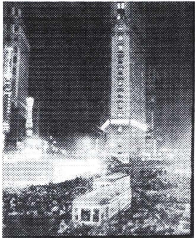
"One night in June 1950 an oddly dressed man was seen in Times Square - which led to the most baffling mystery in the history of the New York Police Department"

"The attendants at the morgue took the whiskers and the clothing in their stride. One meets some odd characters during 20 or 30 years on the force, some of them much odder than he. When they began to search his pockets [sic], their brows began to wrinkle. 'One brass slug, good for one 5¢ beer'. The name of the saloon was unfamiliar even to the old timers.