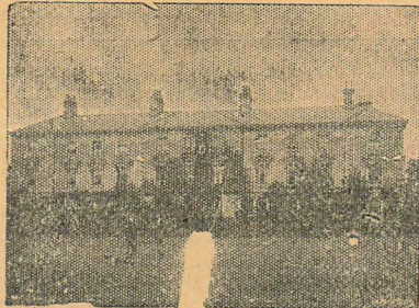
THE HYDRO, LEICESTER.

ANATOMY PHYSIOLOGY PHRENOLOGY PHYSIOGNOMY LOCALISED- PSYCHOLOGY