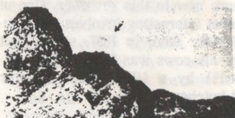
Camerasman on International Geophysical Year vessel took this photo at Trinidadia Isle, Brazil, in 1958.