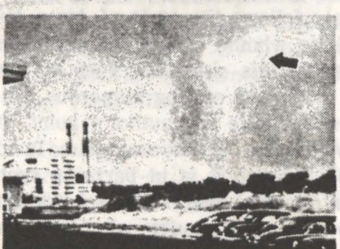
These strange, circular objects are in photograph taken by U.S. Coast Guard at Salem, Mass. (1952).