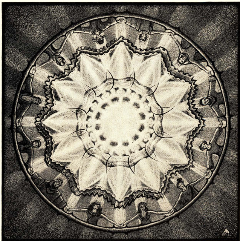
THE WORLD FLOWER