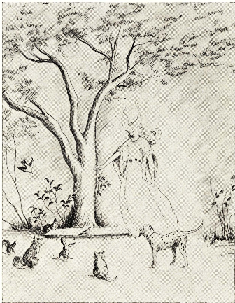
WITNESSING THE LIGHT