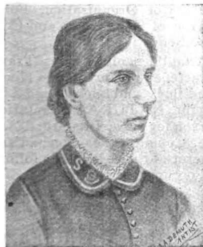
SALVATION ARMY LASSIE.

Our artist has drawn for us the portrait of a "Salvation Army Lassie," in which will be seen the organs of Veneration and Firmness both large and active, rendering the Lassie a religious devotee of strong will, and one not to be deterred