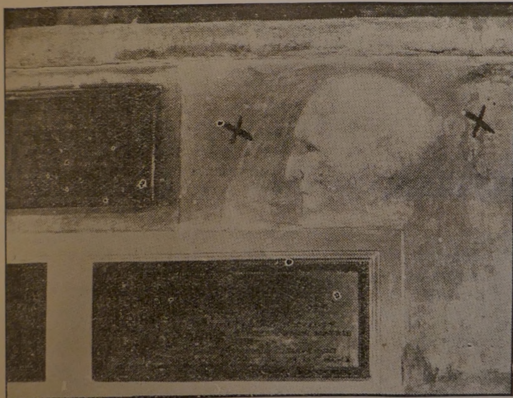
PORTRAIT OF DEAN LIDDELL.