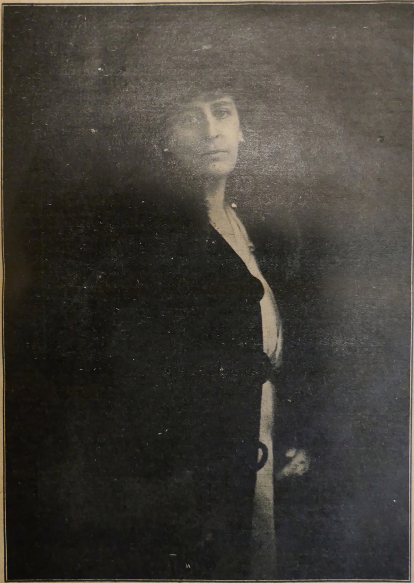
Stirling Studio, Melbourne.

ence in the after state. The object of life, the departed explained, was spirituality, which was simply unselfishness. The further one advanced in spirituality in this life, the less the climb in the next. One could not rely on a deathbed repentance; the repentance might be alright, but one would have to make good in the next life. There was no end to life. God was so infinite that to imagine that dying brought one any nearer to Him was absurd. The condition of a man's spirituality when he departed this life decided his condition or circle of happiness in the next.