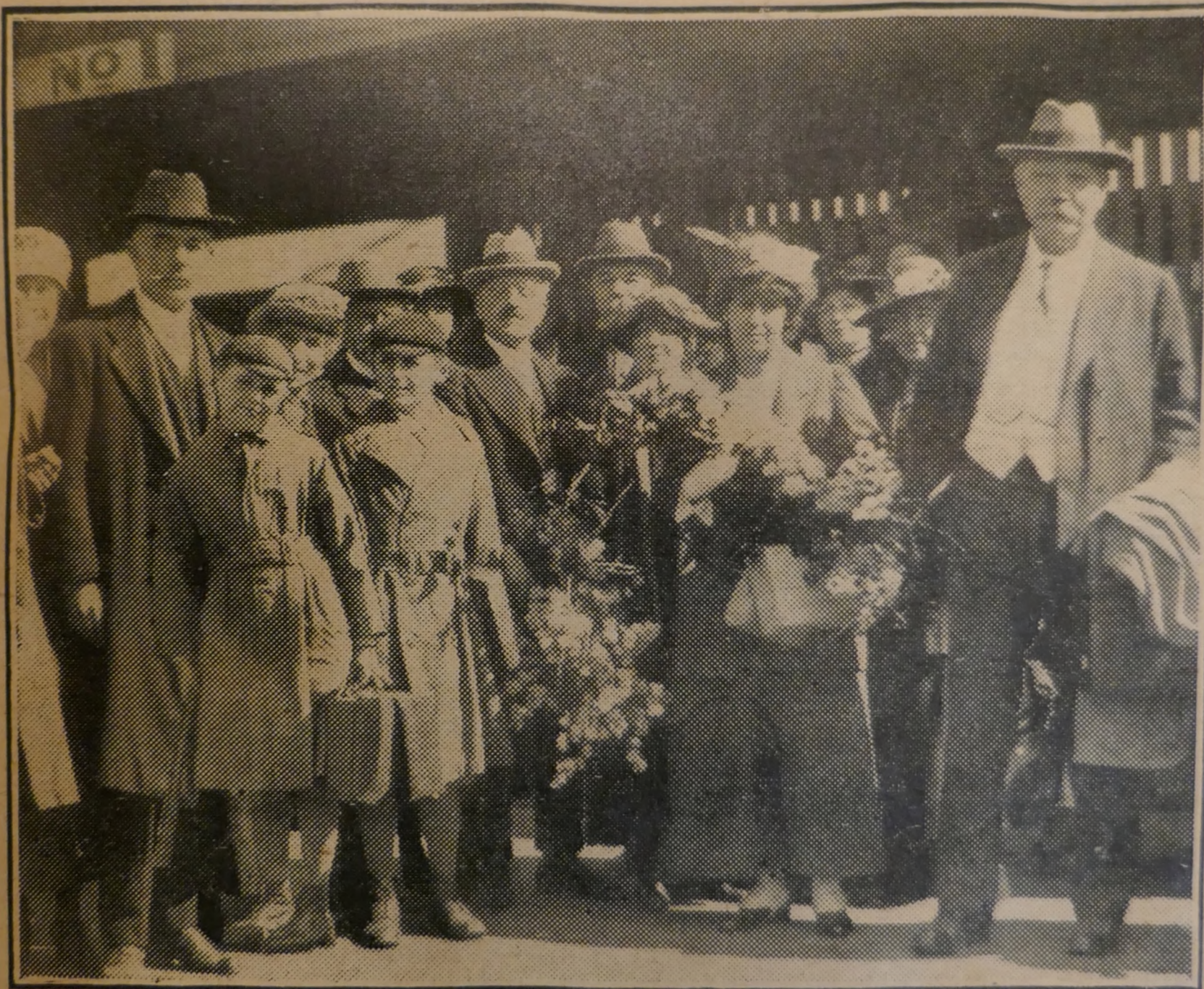
SNAPSHOT AT SPENCER STREET STATION, MELBOURNE.