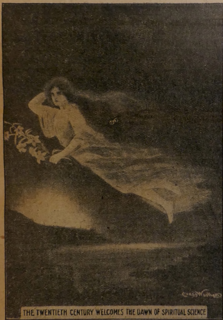
THE TWENTIETH CENTURY WELCOMES THE DAWN OF SPIRITUAL SCIENCE

Sir Arthur's eldest son, by his first wife, was severely wounded in the Great War, and subsequently died from influenza in London. Lady Doyle, too, knows what it is to mourn. Her brother paid the supreme sacrifice at Mons, and Sir Arthur himself also lost a brother at the front. Altogether they lost ten or eleven relatives as a result of the gigantic fight for freedom. This is a very heavy toll, but long before any of these bereavements overtook them, Sir Arthur had pronounced for Spiritualism, and was actually about to lecture on the subject on a public platform when a message was placed in his hand informing him of the passing of his son. He, however, went through with the lecture with Stoic fortitude, and at a later stage experienced the joy of speaking to his boy and brother again.