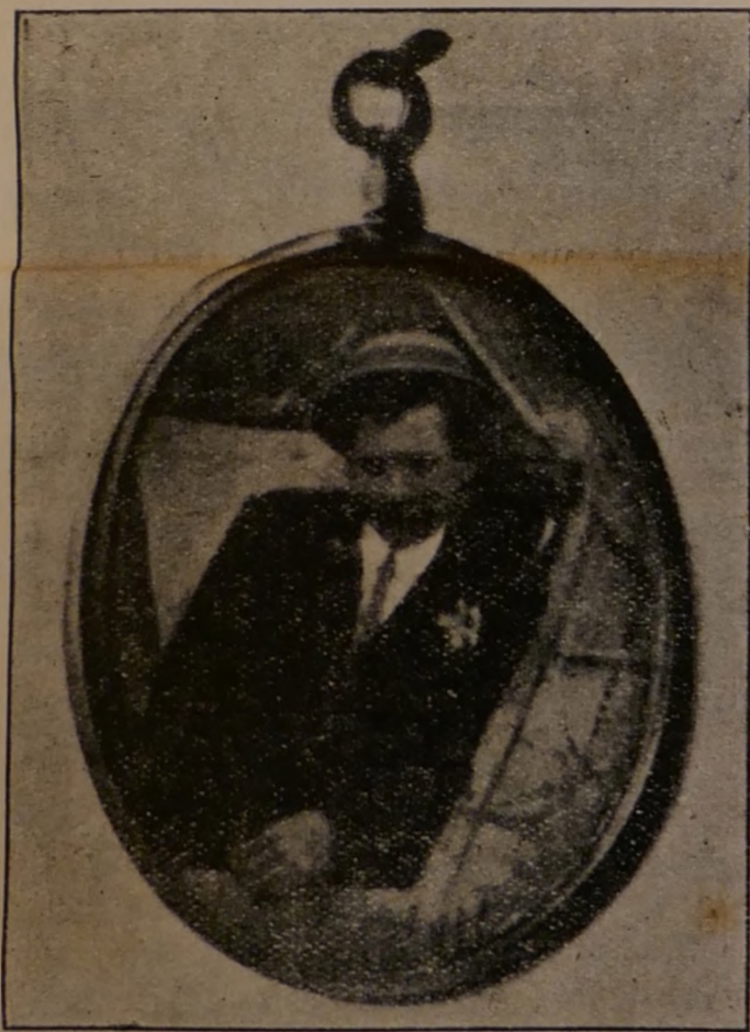
Photograph of the locket, with portrait, which actually measured about 1 inch and a quarter deep.