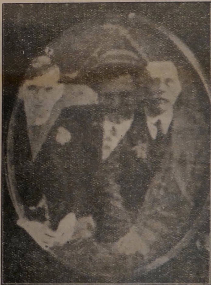
The amazing result after the Crewe seance, the locket appearing enlarged four times.

But this class of super-normal photograph is not the only one of its kind. There are others which