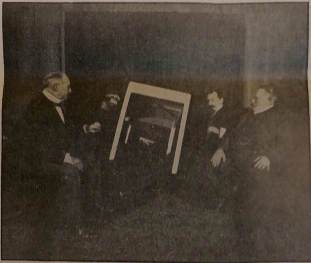
LEVITATION OF TABLE IN PRESENCE OF FRENCH SCIENTISTS.

Without death, which is our churchyard, crepe-like word for change, for growth, there could be no prolongation of that which we call life; never say of me that I am dead.—Browning.