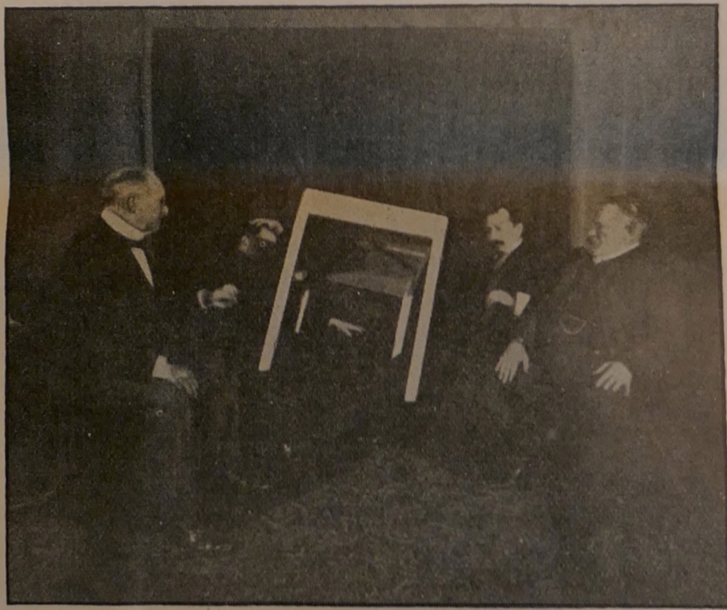
LEVITATION OF TABLE IN PRESENCE OF FRENCH SCIENTISTS.

Without death, which is our churchyard, crepe-like word for change, for growth, there could be no prolongation of that which we call life; never say of me that I am dead.—Browning.