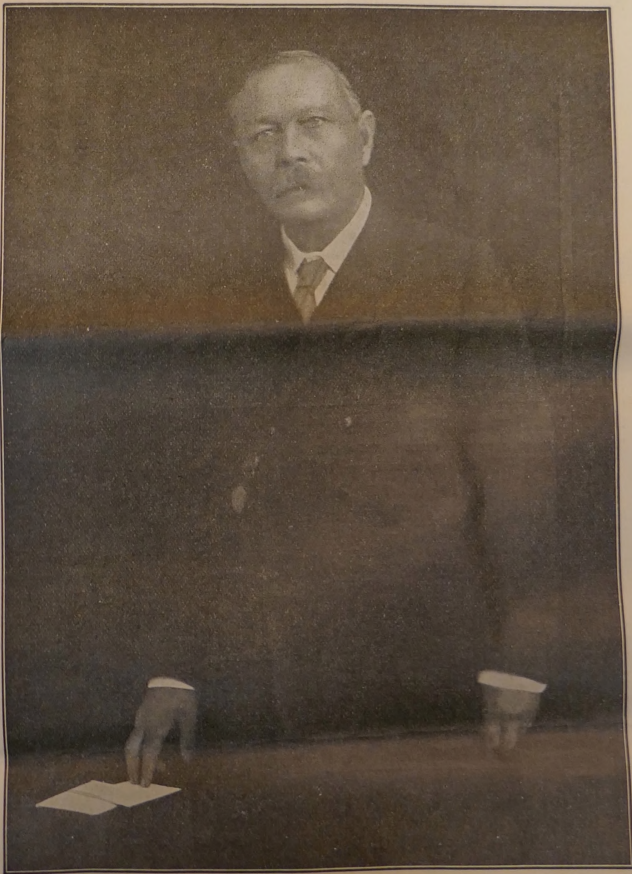
SIR ARTHUR CONAN DOYLE, M.D., LL.D.

IN another portion of this issue we glory in the advent of The Light of the World—the Prince of Peace—the most misunderstood Messenger of Nature gave to mankind one who was destined to become a Light to the present generation and who is certainly a Prince of Peace and an outstanding