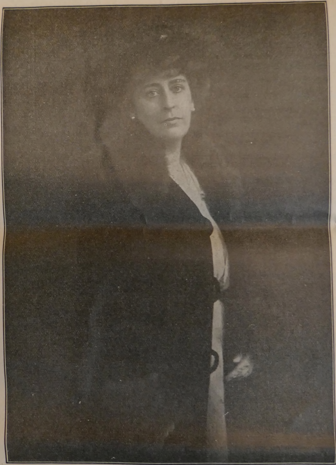
LADY CONAN DOYLE.

spared for many years to disseminate the gospel of the New Revelation throughout the length and breadth of the world. They have, to a very large extent, already accomplished this feat, for in their wanderings they have traversed Australia, New Zealand, the United States of America, and South Africa, and Sir Arthur has now in view a further tour which will embrace the leading cities of the Continent of Europe.