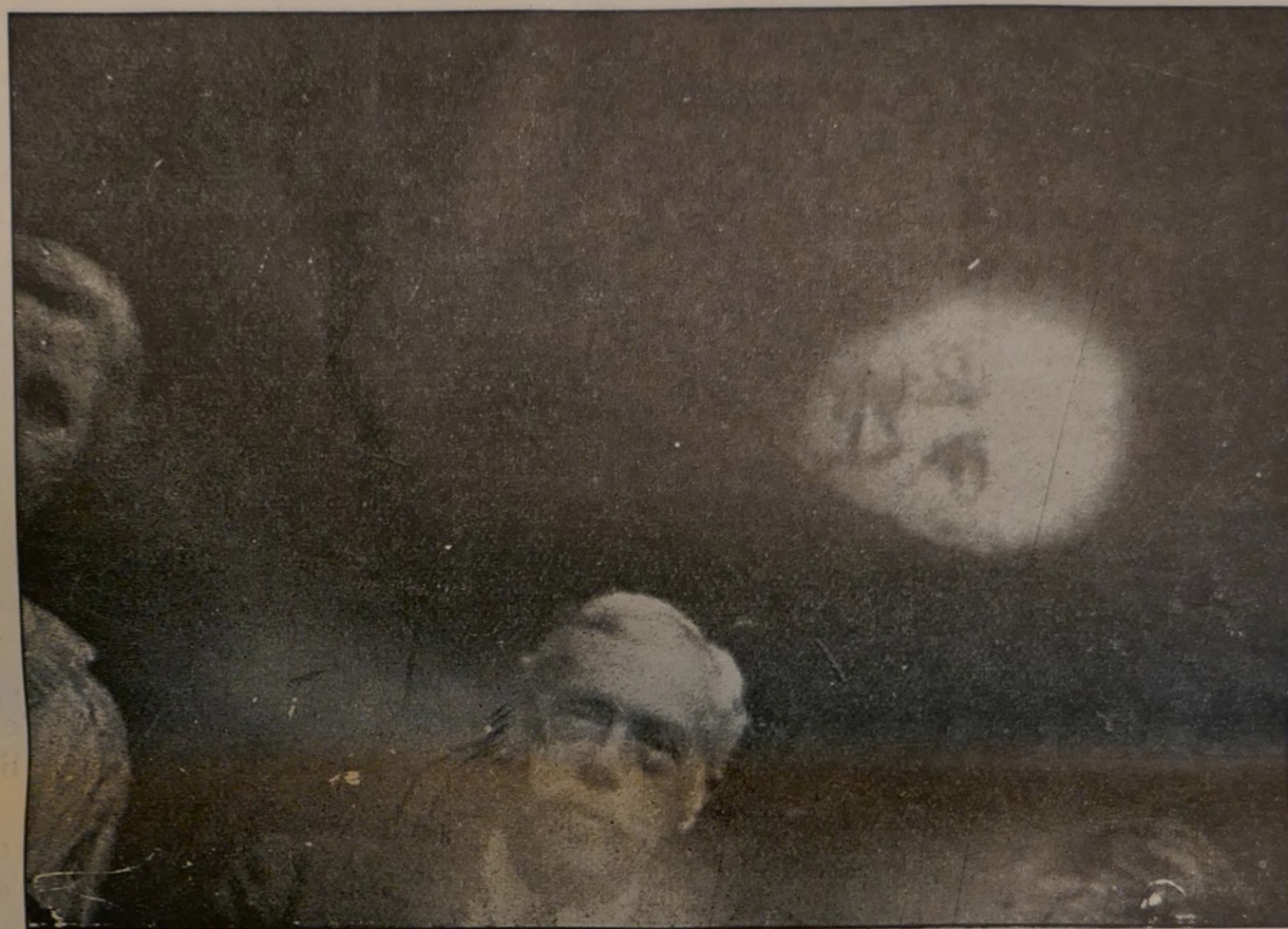
Photograph shewing "extra" of Dr. Geley, taken at the British College of Psychic Science, London, on July 24th, 1924.

The third plate of the batch had a very good portrait of Dr. Geley in nearly the same position relative