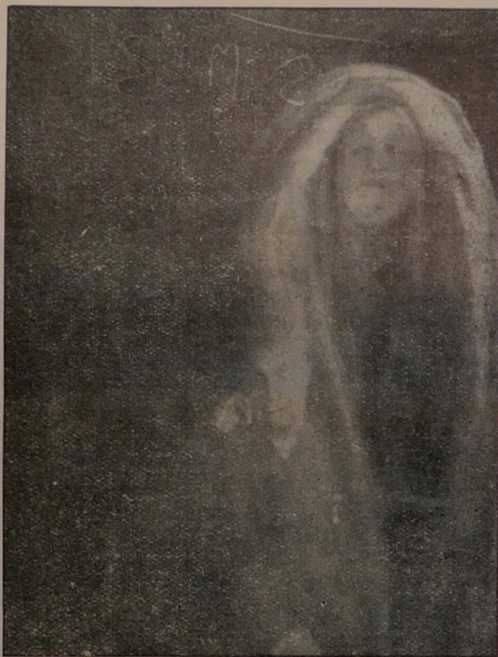
Mrs. W. T. STEAD, WITH PSYCHIC "EXTRA" OF HER HUSBAND.

millions of those cut off by death there should be any individual recognition intended? The demonstration is one of world-wide import, a message to the race at large, and the faces typical of British youth; symbols only of a larger hope to those that remain in the valley of tribulation and perplexity. Identification in such a case is bound to be difficult, and even if claimed, could always be disputed, for none of the faces is large enough nor sufficiently sharp in outline to establish the assurance of personal identity. All are types that may be paralle-