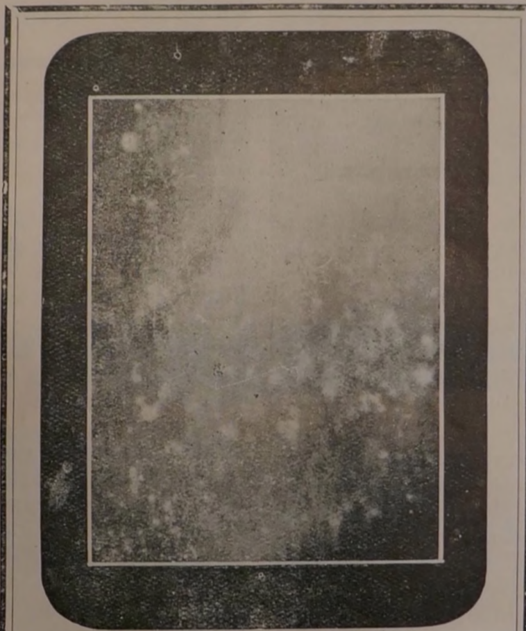
SHOWER OF HEALING GLOBULES.

During this interesting psycho-medical experiment, I experienced for the first time the novelty of alternate periods of being bathed in hot, and then cold, magnetism. Magnetism is fluidic in its nature,