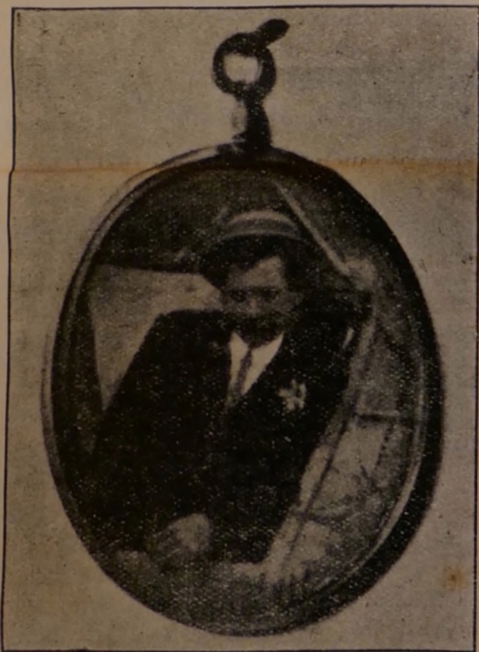
Photograph of the locket, with portrait, which actually measured about 1 inch and a quarter deep.