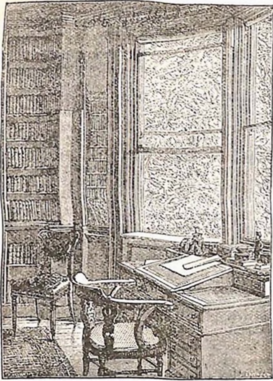
Charles Dickens' Study at Gadshill.

writers who make their mark. In this as in other work, we are not sent into this world to be automatons. Those who achieve fame in any department of life are not those who wait for so-called "guides" to do their work for them, but who with mind and soul in tune with the infinite, are open to the waves of inspiration that come from the spheres, which they use with all the skill that training and industry can alone give.