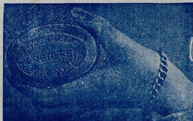
Contains no Animal or Mineral Fat.

THE AID TO BEAUTY FREE SAMPLE Sent on Receipt of Twopenny Stamp.