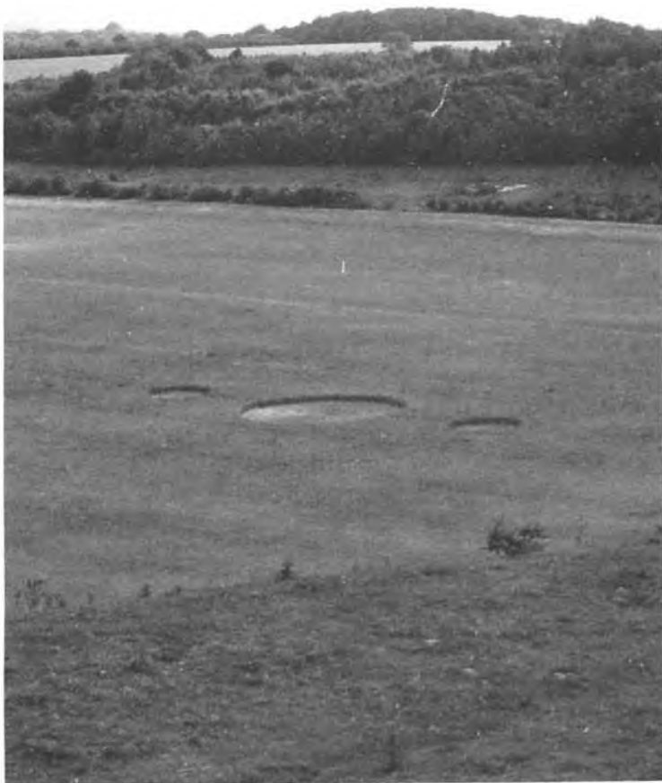
The Cheesefoot Head rings 1981

brushed flat in a clockwise direction, and the "walls" of all five circles were sharp and vertical, also as in 1981.