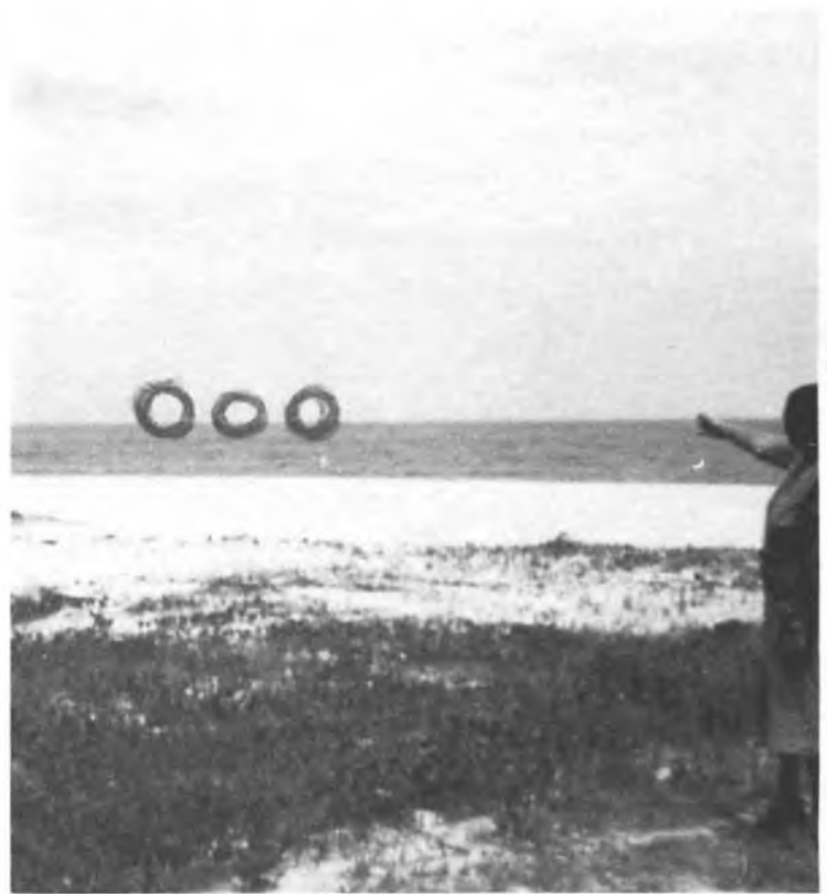
Luli Oswald indicates position of lights (sketched in)

Luli was surprised to see the three lights again on the horizon, out over the sea, and being a musician, a concert pianist, started counting mentally to herself: "one, two, three; one, two, three", many times, until, at a given moment, F.G. said: "Have you noticed that there are lights coming up out of the sea?" And, in fact, there were other lights coming out of the sea, in addition to the three lights in the distance, and there seemed to be a dark shape, like a vessel. As the lights rose up, the waters of the sea came up in the form of a