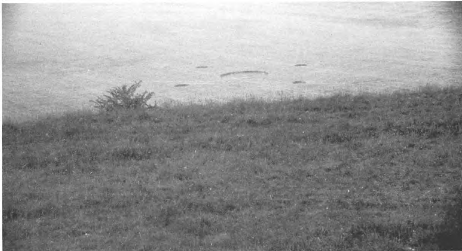
The Cheesefoot Head rings 1983

Since my notification of the new rings at Cheesefoot Head to TVS and BBC South and the local paper, the Hampshire Chronicle , further rings of identical pattern