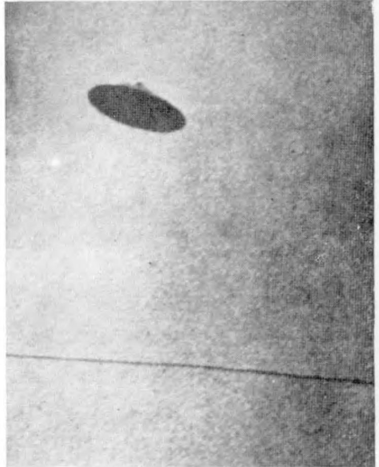
Camera: "Alpa-Alnea 7" with tele-objective 75, 1:3, 50. Diaphragm: 16. Velocity: 250. Film: Plus X.