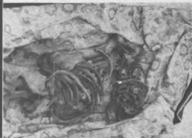
Chief Black Foot was a large man — as shown by measure of his jaw and teeth. Bones show he was over six feet tall.

Bones were found half-buried in sand on floor of cave. Searchers reverently gathered them to return to reservation.