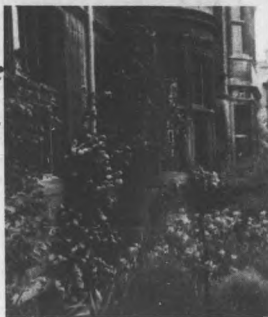
Redondo Beach Inn perched on banks of Puget Sound, its large bay windows looking out over the waterfront.

I thought the child probably didn't like lettuce and made up this story so that she wouldn't have to take any. But this old mansion was a perfect setting for a ghost. The restaurant which we called the Redondo Beach Inn had been built in 1934 by one Sir Chester Vine. It perched on the banks of Puget Sound in Redondo Beach, Wash., its large bay windows looking out over the waterfront. All of the elegance of the 18th Century permeated the