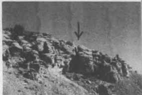
Great chief was buried in "white man's land" — a cave in sandstone cliffs on Pitchfork Ranch near Meeteetse, Wyo.