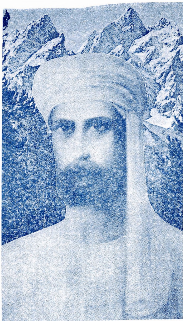
Beloved El Morya