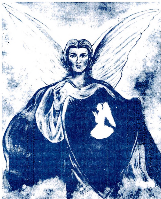
BELOVED LORD ZADKIEL