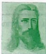
KUTHUMI World Teacher

coming" which is imminent, and I have already prepared the new Christus Who but awaits the propitious moment for His Advent!