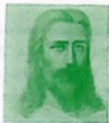
KUTHUMI World Teacher