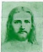
JESUS World Teacher