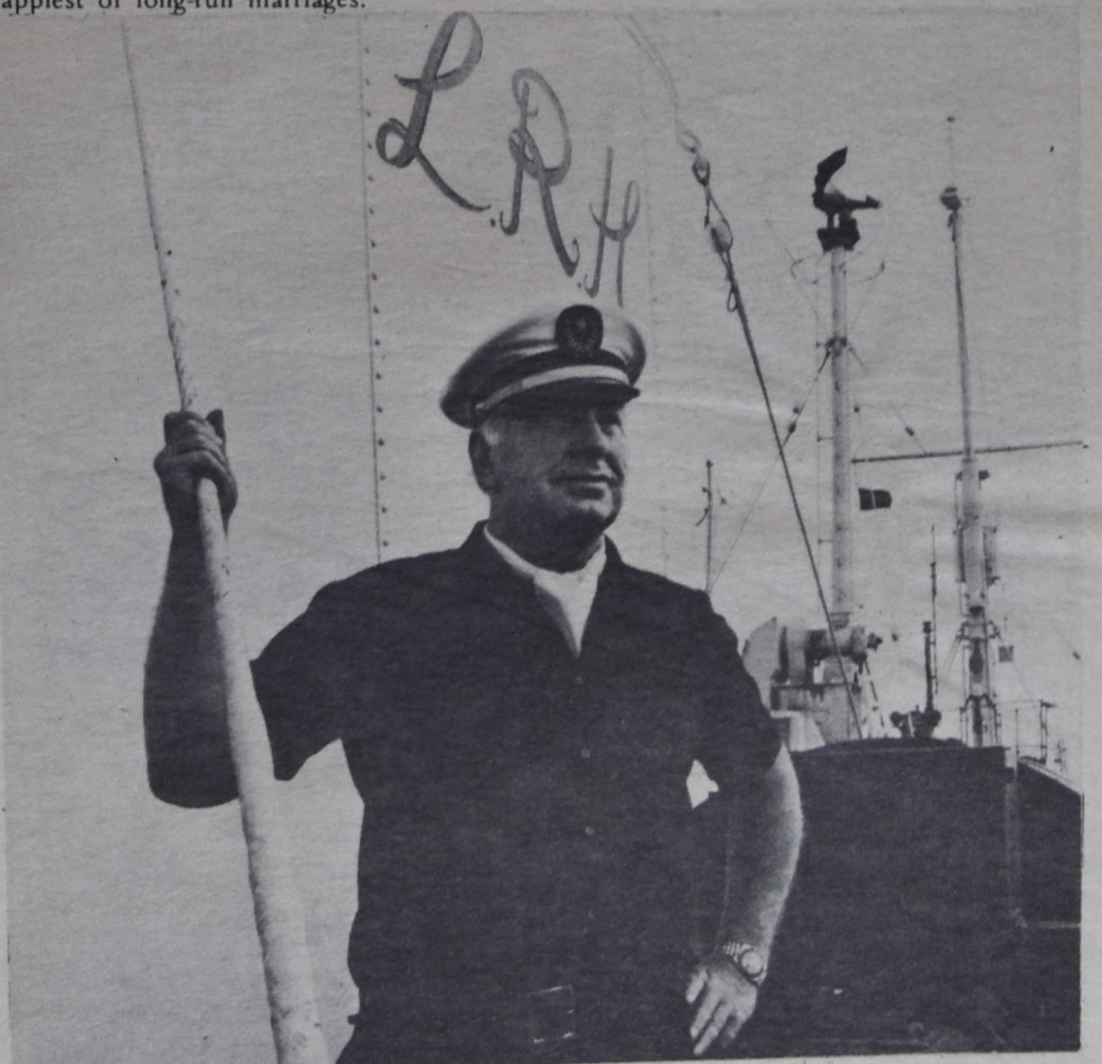
L. RON HUBBARD