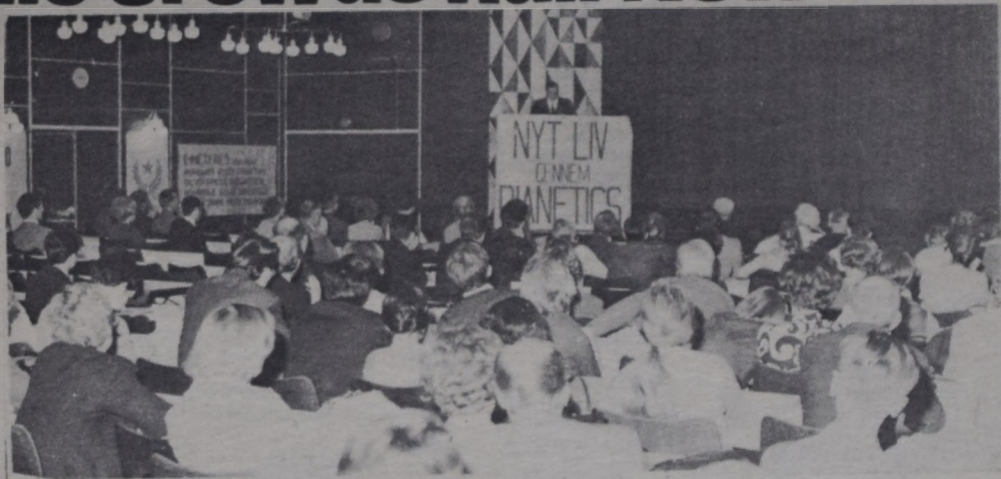
"New Life Through Dianetics" sets the theme of the Dianetics Congress given by the Church of Scientology of Denmark.

Ron's tapes were especially translated for several European congresses. At the two Danish orgs in Copenhagen, congress attendees were delighted to hear the congress tape 'Handling Psychosomatics'