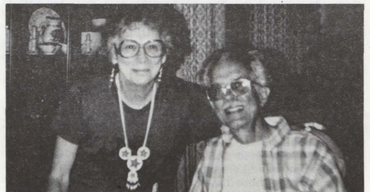
The last photo of the Lorenzens' taken together - fall of 1985.