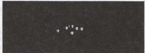
Another shot of the alleged "UFO"