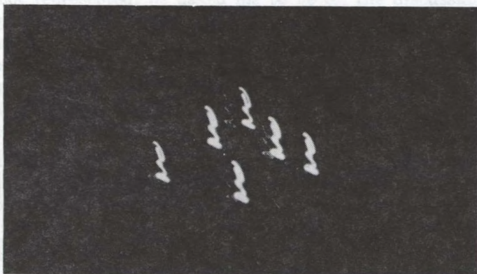
Stormville Pilots Overhead See column two