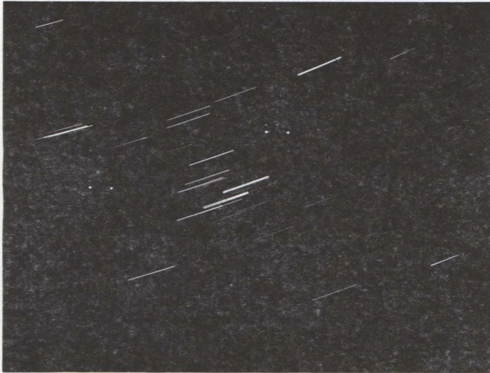
Time Exposure - See Column 2