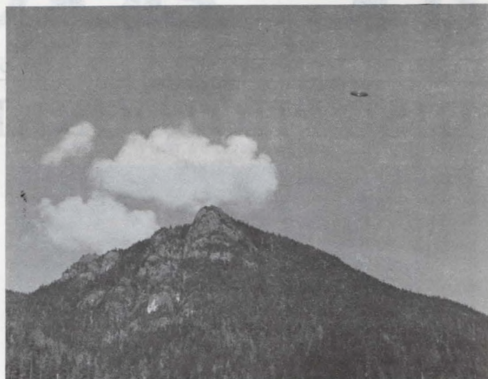
Canadian Photo See Disc, upper right

3. With the right equipment, it is possible to make certain measurements of negative density of the UFO image and of other images of objects at estimated distances from the lens. Here the object is to show that the unknown is not nearby—and thus not a nubcap or other such object thrown into the air. The idea is to measure, from the image of the object at a known distance, the atmospheric "extinction coefficient." On a clear day, with a low value, contrasts between dark shadowed areas and brightly lit areas retain their distinction over greater distances. On hazy days, the light and dark areas blend towards a mid-range shade, giving the appearance that distance mountains have of