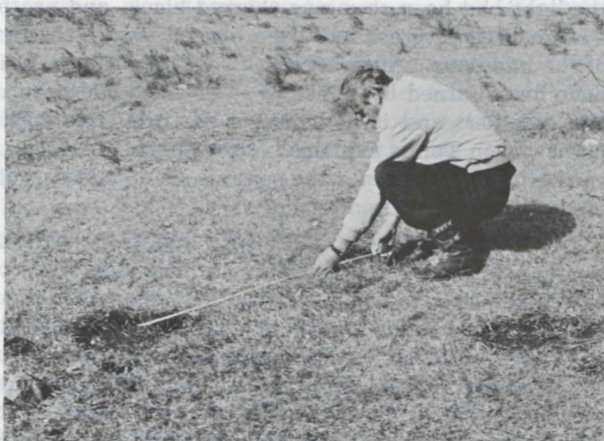
Author Van Der Velde measures pod impressions.

"The object, still flaming, moved at a right angle to the south about 100 meters over a meadow where there was a bull and a horse. It hovered for a few seconds over the cattle bath, then moved northward, overtaking Topo. As Topo ran into the darkness, the object turned back toward me, approaching within 20 meters, paralyzing me and temporarily blinding me. I calculated the diameter of the object to be about three meters. The next thing I knew the brilliant white light turned a vivid red. Slowly gaining altitude, it headed toward the woods where the first object had been seen five days before. Once it reached the woods, it shot into the sky at tremendous speed and disappeared."