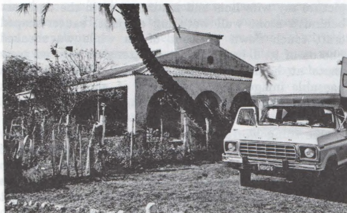
Pedro Romaniuk's camper stands next to the ranch house at the estancia La Aurora. Most of the UFO sightings were from the immediate grounds of the house.

At each location, we saw the same sight—a large circle on the ground where the grass had been burned away, then had grown back much greener than the surrounding grass. In each circle there were three impressions, forming a triangle, as if they had been formed by pod-shaped landing gear. In these impressions no grass had grown back, even though some of them were more than three years old. Each of the impressions was approximately two feet in diameter. The grassy circles varied from about 20 feet to 100 feet in diameter, and the indentations, or pod marks, were spaced farther apart when located in the larger circles. Next to each pod mark was a smaller indentation, varying from two to three inches in diameter. Again, vegetation had not grown back in these smaller indentations regardless of age. Each of these small impressions was located a few inches from the larger pod marks, and always on their outside edge, that is, on the edge facing the outer rim of each grassy circle. In this respect, the impressions at La Aurora seem to be unique. While we had heard about and seen photographs of apparent pod impressions in other parts of the world, we had never seen smaller circular impressions next to them. Romaniuk believes these were formed by “probes”—shafts extended from each pod of a landing gear to test the ground for firmness, ascertaining whether or not it was capable of supporting the weight of a heavy craft before a final landing was completed.