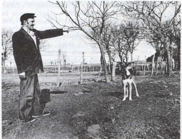
Don Tonna stands in the same spot he stood when he was badly burned by a UFO. His dog is also in the same location, but it is a different dog. The first was killed from radiation.

Romaniuk believes that the grassy circles were formed by some type of “magnetic radiation,” which fertilized the soil, causing grass to grow greener there. At the same time, he feels that some form of intense energy first struck the ground from the probes and pods, causing those areas to become infertile. He believes this magnetic radiation to be harmless, despite several “Danger—Radioactive Area” signs installed at various locations around the ranch by the Uruguayan Army.