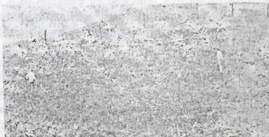
THE WIAMATA VALLEY DECEMBER 20, 1977, AND JANUARY 26, 1978, LANDING SITE.

Two Gisbourne women saw a bright yellowish light at 11:50 p.m. on March 1, 1978, for almost half an hour. The light moved in a circle, then later disappeared into the distance.