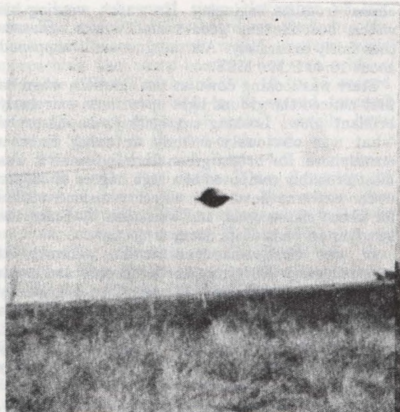
The Passo Fundo Photo

in the back seat for his Kodak Rio Camera which was loaded with color film.