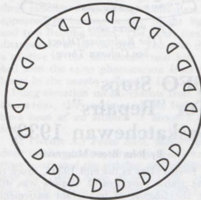
VIEW OF BOTTOM WITH LIGHTS SHINING THROUGH HOLES

Its movement was in uneven spurts, shooting forward and then stopping. On one stop it tilted toward the car. It was shaped like an upside down saucer with a flat bottom and a dome on top in the middle. Near the bottom edge could be seen a row of individual lights which merged into a single blur when rotating. The lights changed color, alternating between blue, green and bright white. Atop the dome were three lights on the ends of which appeared to be antenna: two small white lights, and one larger red light.