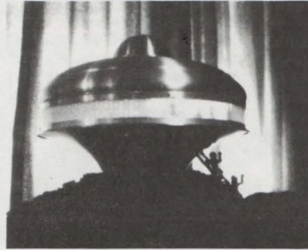
Photo of UFO Model