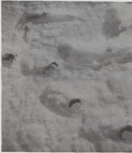
Frederic, Wis. tracks – see below