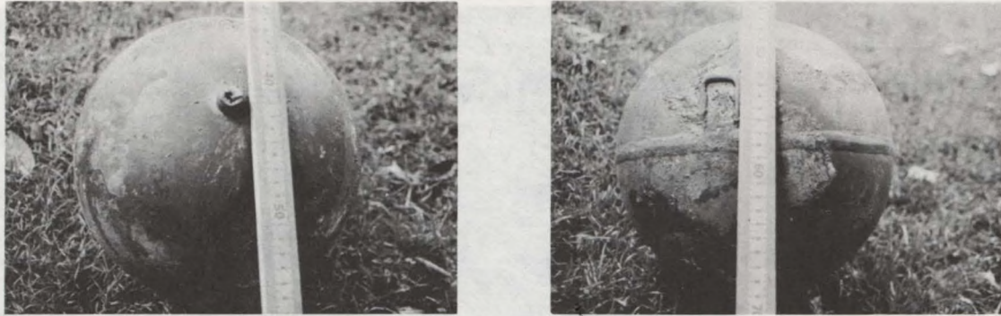
Two views of the mystery sphere found at Lowell, Ohio.