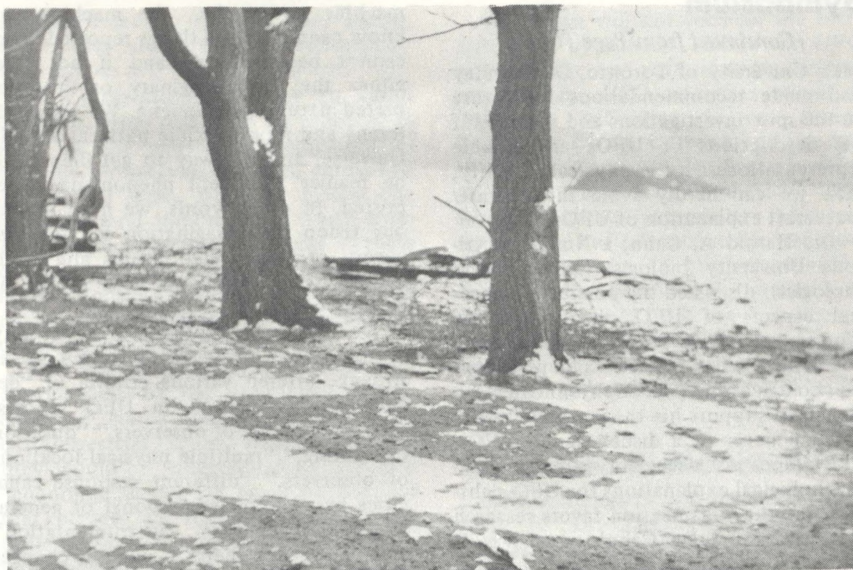
Shown above is the ring described in the Kansas landing case. See page 1 and left.