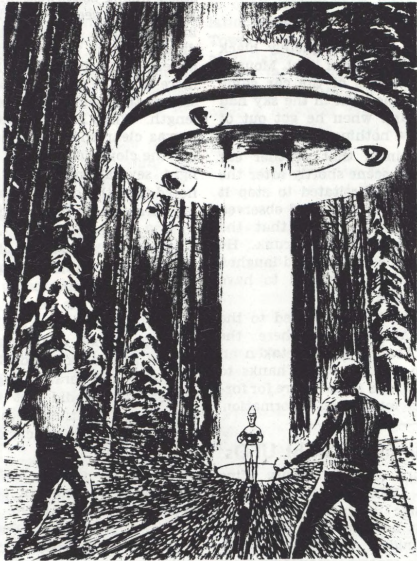
See Finnish Occupant story, this page.