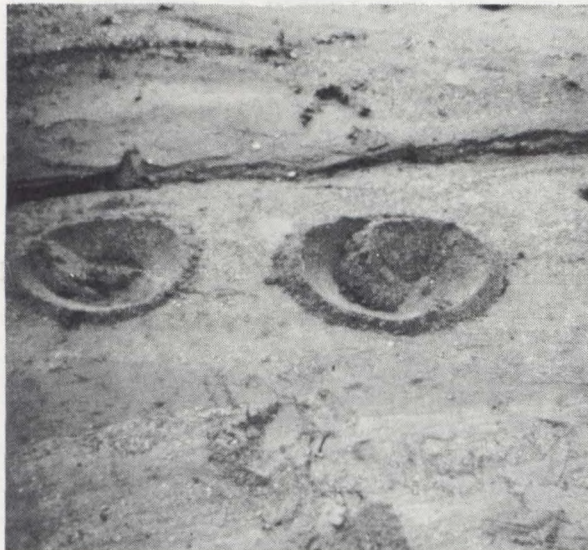
Shown above are two views of impressions left by object which landed at Tucson. See story below