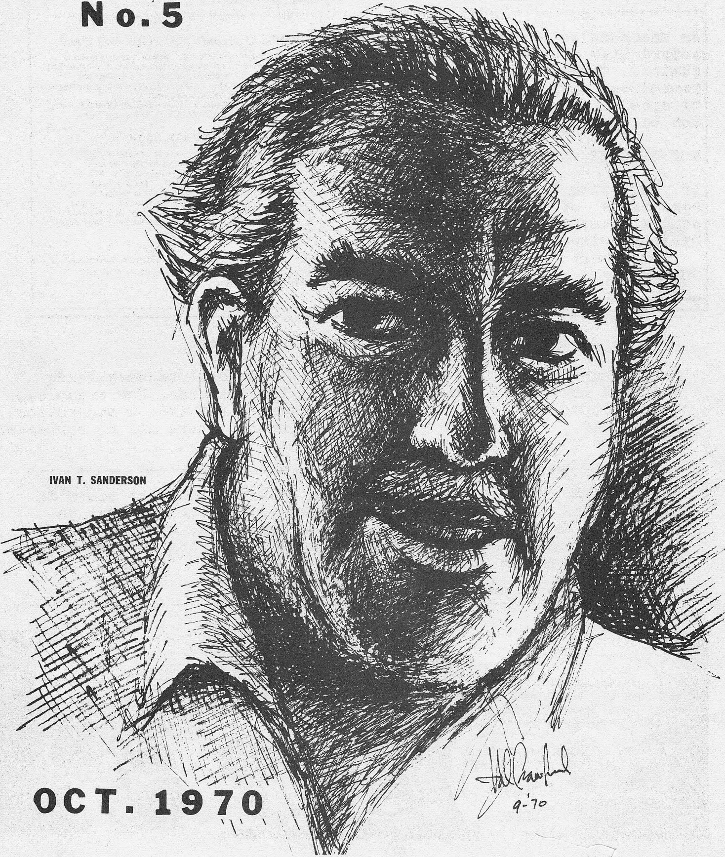
IVAN T. SANDERSON