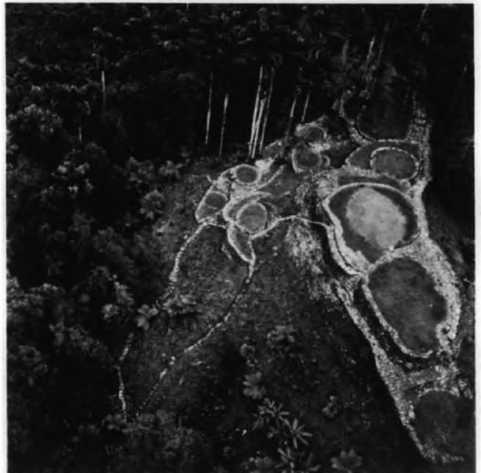
Aerial view of central plaza of BURITACA 200

*The author of Chariots of the Gods? , Erich von Daniken now has ten books published in the ancient astronaut field. His latest book in English is now available in the US in hardcover from G.P. Putnam's Sons, New York, under the title Pathways to the Gods . His latest book in German will be available in English later this year under the title The Strategy of the Gods . Mr. Von Daniken will be one of the speakers at the Ancient Astronaut Society's Tenth Anniversary World Conference in Chicago on August 6-7, 1983. His address is Baselstrasse 10, 4532 Feldbrunnen/SO, SWITZERLAND.