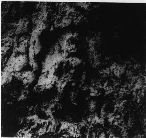
Rock-face carving, Lake Miramar

The Ancient Astronaut Society, founded in 1973, is a tax-exempt, not-for-profit corporation organized exclusively for scientific, literary and educational purposes.