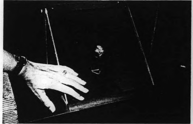
METAL BALL FOUND IN PYROPHYLLITE. Now on display in the Klerksdorp Museum, South Africa.

The Ancient Astronaut Society, founded in 1973, is a tax-exempt, not-for-profit corporation organized exclusively for scientific, literary and educational purposes.