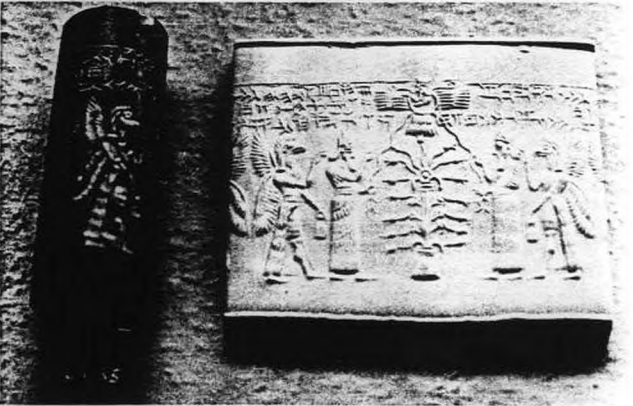
SUMERIAN CYLINDER SEALS DEPICTING "MAN-ANIMALS." About 3,000 BC. Now in the British Museum, London, England.

ANCIENT SKIES is published bi-monthly by the ANCIENT ASTRONAUT SOCIETY, 1921 St. Johns Ave., Highland Park, Illinois 60035 USA, for distribution to its members. Telephone (312) 432-6230.