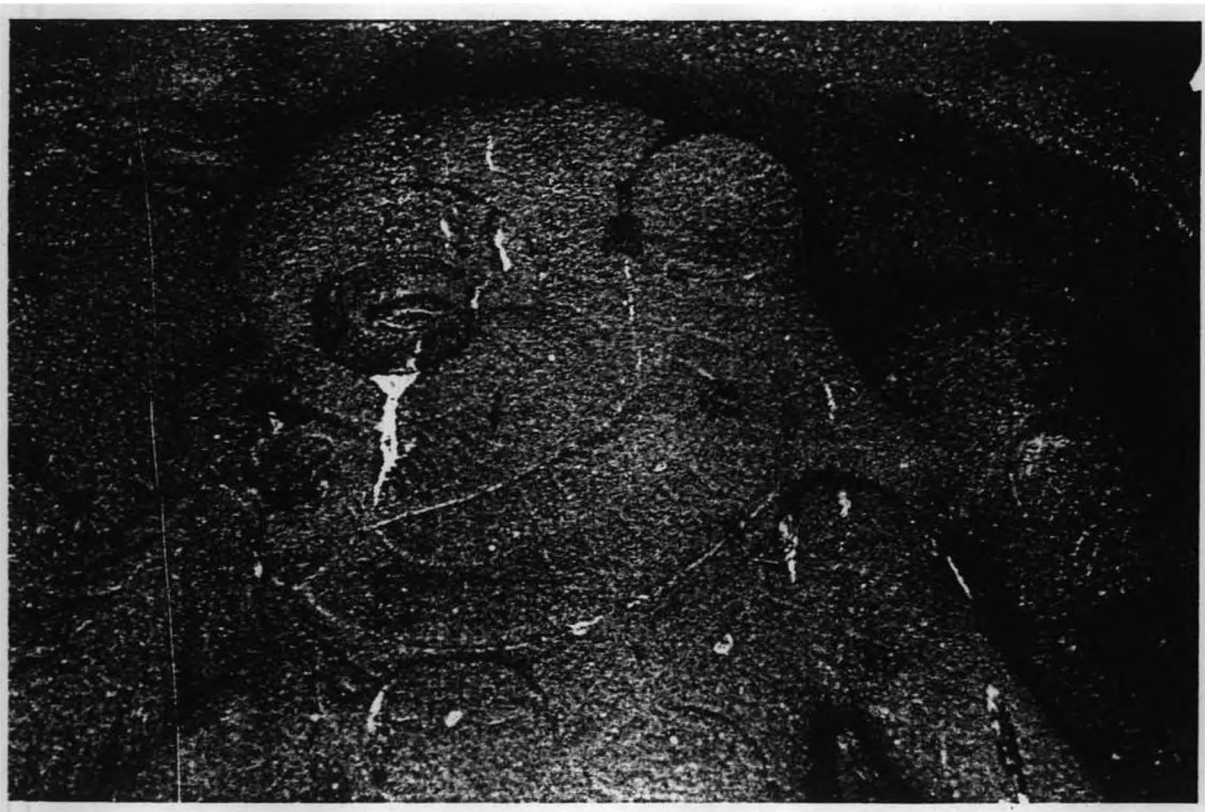
CLOSE-UP VIEW OF HELMETED FIGURE CARVED IN DEEP RELIEF ON STONE STELAE AT EL BAUL, GUATEMALA

Laszlo Toth, 8800 Nagykanizsa, Oswald ut. 4372, HUNGARY.