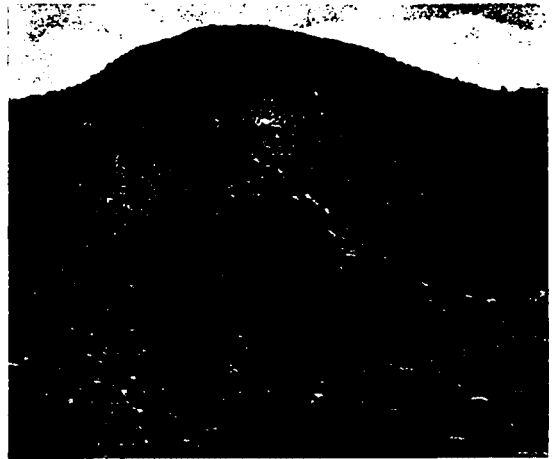
Pyramid in Brazilian jungle near site of Akahim.

*Mr. von Daniken is the author of Chariots of the Gods? and other books in the ancient astronaut field. His latest book, Von Daniken's Proof , is available in paperback. His books have been published in thirty-five languages and have sold more than 43,000,000 copies throughout the world. Mr. von Daniken has delivered over 1,100 lectures in 22 countries. He lives at Baselstrasse 10, CH-4532 Feldbrunnen/SO, Switzerland.