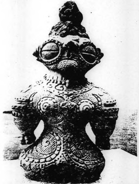
Figure 1. Typical Japanese Dogu