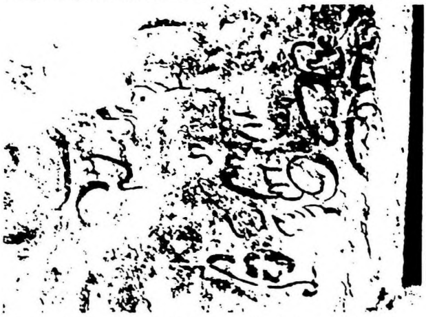
Figure A. Script on Palace Wall, Palenque, Mexico.

I was fascinated to see the reproduction in Ancient Skies 5:2 of the writing on a wall of the Palace Complex at the Mayan ruins at Palenque, Mexico. See Figure A. As a student of ancient Japanese script, I was struck with the similarity of the characters. See Figure B. While I cannot decipher any of the characters because of the deteriorated state of the wall, I believe the writing to be ancient Japanese. Our history records Japanese explorers travelling to all parts of the world over 50,000 years ago, and they specifically visited parts of Central and South America! It is also interesting to note the great similarity between the sound of the Japanese language, and the sound of the Quechua and Aymara languages still spoken by the Indians of the Altiplano of Peru and Bolivia. Katsumi Koosaka, 12-1, Jinyamae, Tokiwadaira, Matsudo-shi, Chiba-Ken, JAPAN.