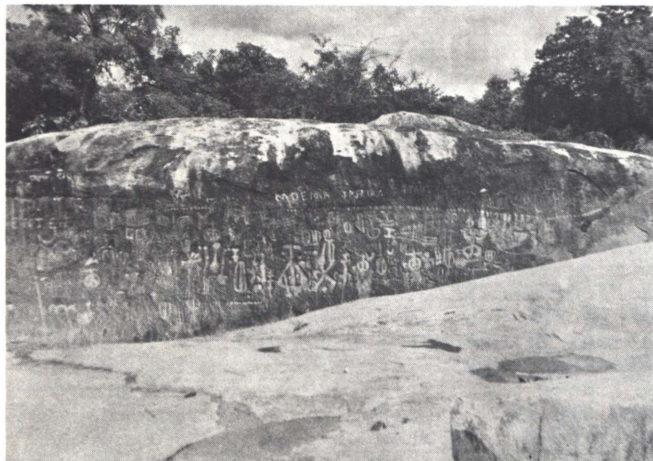
THE CARVED STONE OF INGÁ - Overall View

The Carved Stone of Ingá is located in the Itacoatiara National Park in the State of Paraíba, Brazil. Paraíba is in the easternmost section of the country on the Atlantic Ocean. The stone can be found at 5 Km (3.1 miles) southeasterly from the town of Ingá, Latitude 7° 18' 51" South and Longitude 35° 35' 6" West of Greenwich. Ingá is 46 Km (28.6 miles) from my home city of Campina Grande.