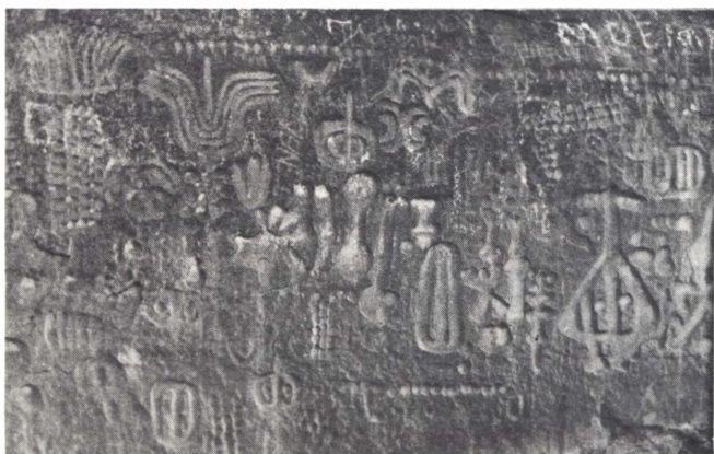
Detail of left side