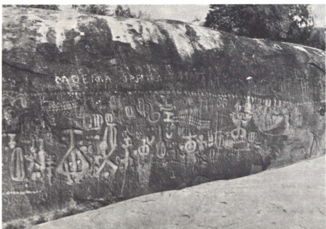
Detail of right side

I measured the stone at 23 meters (75.5 feet) in length and 8 meters (26.3 feet) in width. Most of the inscriptions are on the northeast face, and cover all the lower portion of the stone. I could distinguish 302 separate drawings, 210 of which are capsular shaped and the remainder of strange, distinct symbols. The inscriptions on the Ingá Stone are far superior in number, technique and aesthetic sense to other petroglyphs found in Brazil.