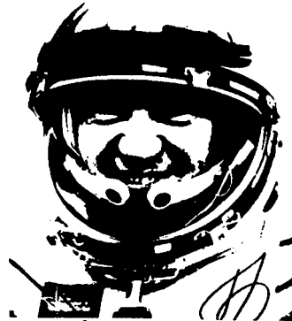
G. M. GRECKO, sovjetski kozmonaut Letio u svemirskoj stanici "SOJUZ-4" i svemirsku bradu "SOJUZ-17"

I am very proud that the discussions will take place in our quiet Adriatic town, far from the rush of the big city, where our peaceful atmosphere will surely affect the work, rest and pleasure of the participants, and enable them to come closer to each other as friends. If this goal can be fulfilled, the Commune of Crikvenica shall have paid its tribute to the success of the Third International Congress of the Ancient Astronaut Society.