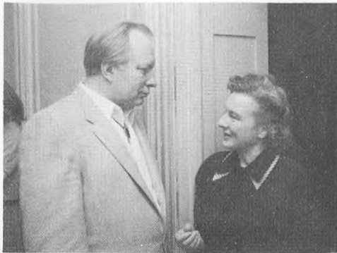
21st AMERICAN A. C. C.