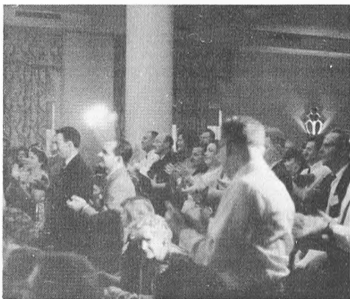
Some of the Congress attendees giving a round of applause at the last lecture.