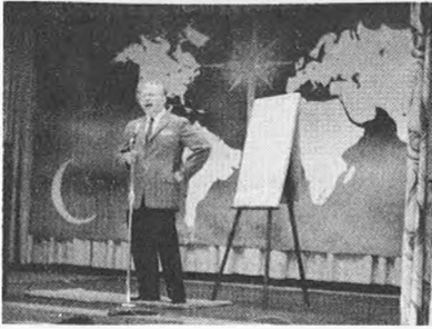
L. Ron Hubbard Speaker